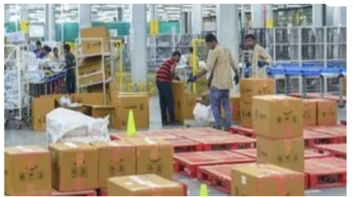
Warehousing in India operates within a legal framework designed to govern the storage, distribution and management of goods. (IE)